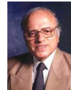
Prof. M. S. Swaminathan Chairman of the UNESCO Ecotechnology at the M S Swaminathan Research Foundation in Chennai (Madras)