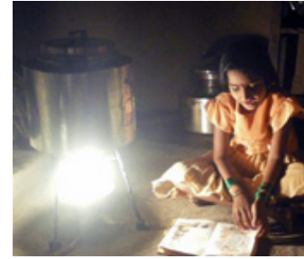
Sustainability Research Award