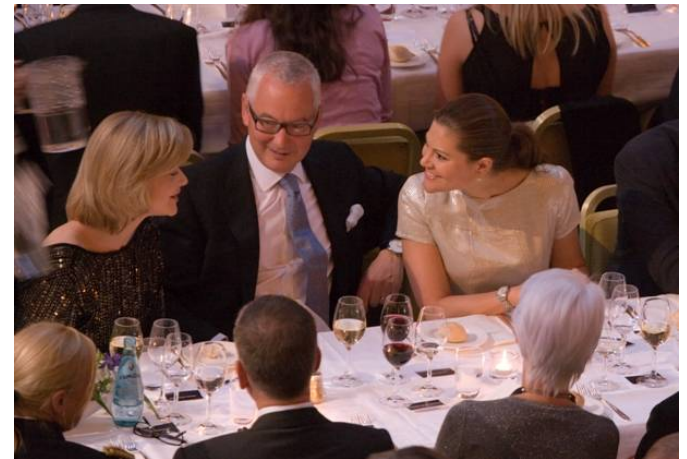
H.R.H. Crown Princess Victoria of Sweden